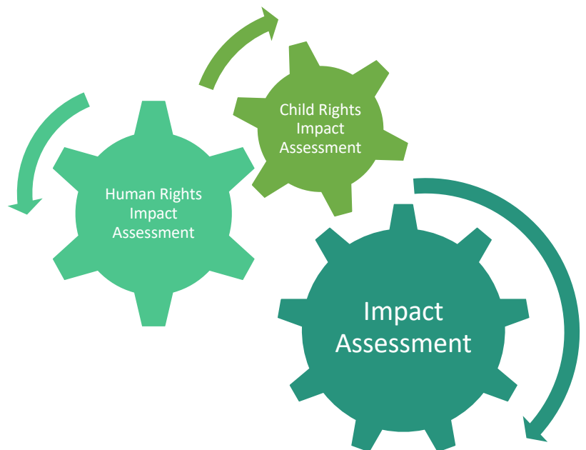
Fig 1. Impact assessment and its relation to HRIA and CRIA

This report explains CRIA's nature and potential as a tool for policymakers, businesses and other actors involved in the design, development, deployment, and governance of digital products and services that directly or indirectly impact children's rights. Noting that there are growing calls for CRIA, it concludes that CRIA should now be applied to the design, development and distribution of digital products and services to realise children's rights in the digital world.